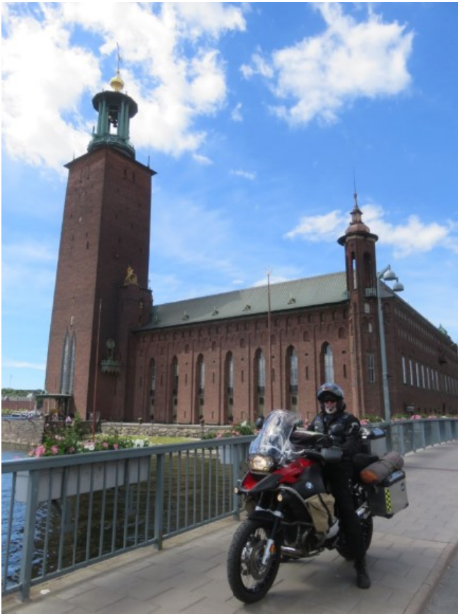
(City Hall Icon of Stockholm Sweden)